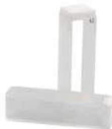
Square cuvettes glass/quartz 1-5mm/10-100mm