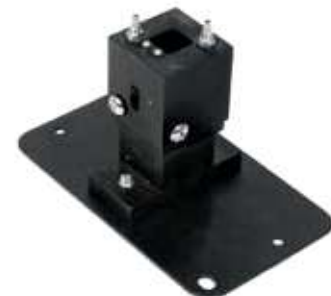
Cat. No. 18900335 10mm water-jacketed 1 cell holder (for SP-V1100 & SP-UV1100)