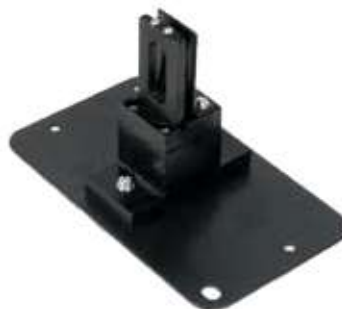
Cat. No. 18900339 solid sample holder (ø1.5-3mmø1 position)