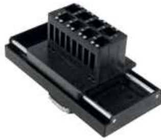
Cat. No. 18900340 8-position auto cell changer (for SP-V1100&SP-UV1100)