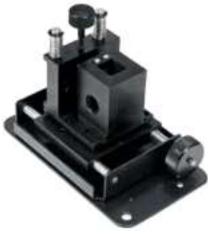
Cat. No. 18900337 Micro Cell holder