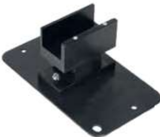
Cat. No. 18900334 cylindrical cell holder(ø16mm)