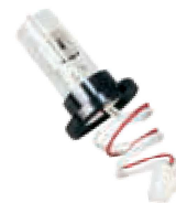
Cat. No. 18900342 Milas deuterium lamp, 10V, 300mA, 30W (for SP-UV1000&SP-UV1100)