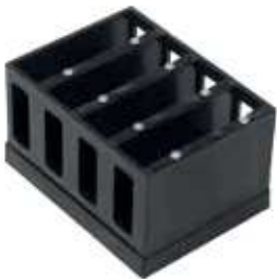
Cat. No. 18900332 4-cell holder for 10mm to 50mm sq. cuvette