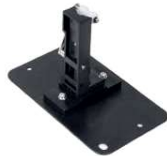
Cat. No. 18900338 Test tube holder(ø8-ø22mm)