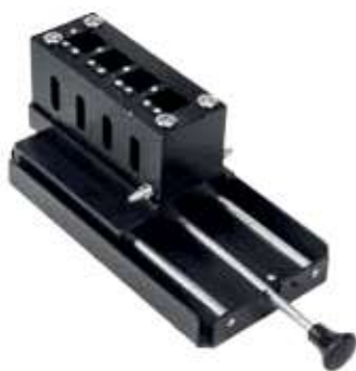
Cat. No. 18900336 10mm water-jacketed 4-cell holder (for SP-V1100 & SP-UV1100)