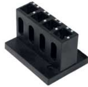
Cat. No. 18900331 4-cell holder for 10mm sq. cuvette