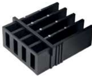
Cat. No. 18900333 4-cell holder for up to 100mm sq. cuvette